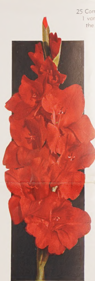
AMERICAN COMMANDER $1.65 for 10 $14.00 per 100